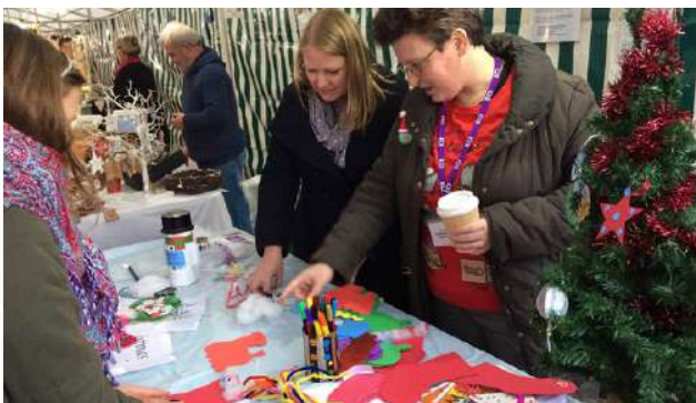
SLNA Magdalen Rd Christmas Fair