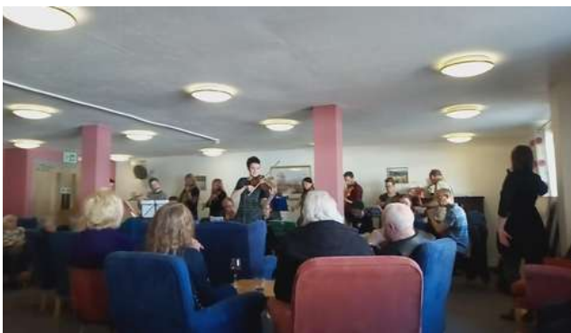
Newtown Roots Band at Eaton House