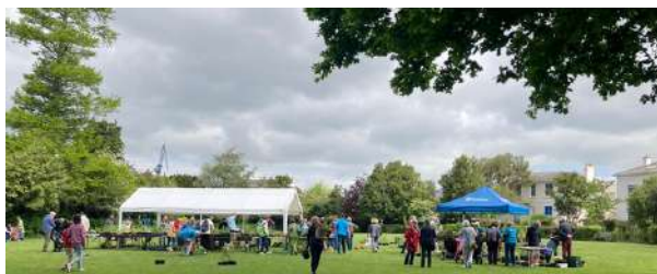
Barings Crescent Plant Sale