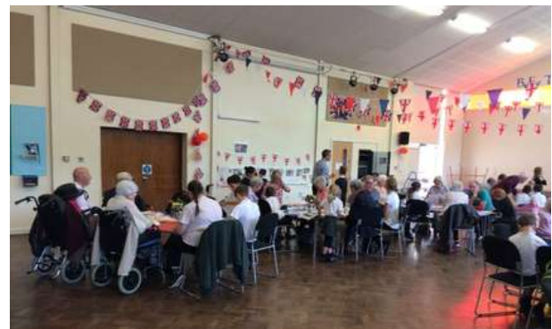
SLNA & St Leonards Primary School Linking Generations