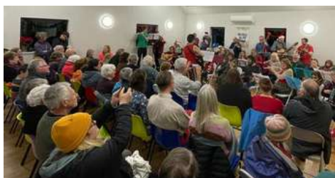
NCA Winter Warmer