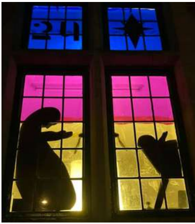
Living Advent Calendar