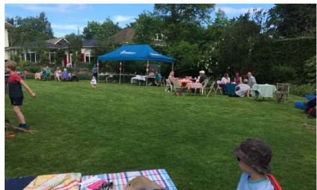
Garden Charity Open Day at Orchard House