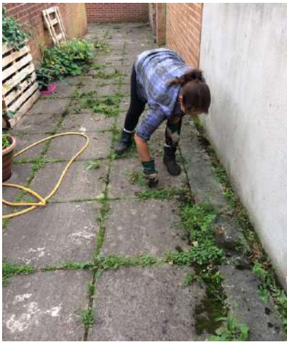
Newtown Alleyway tidy