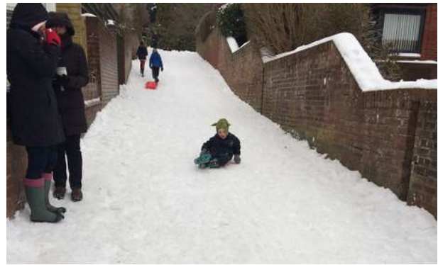
Athelstan Road Snow Fun