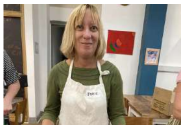
St Sidwell Centre Community Events