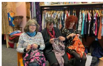
St Petrocks Patchers