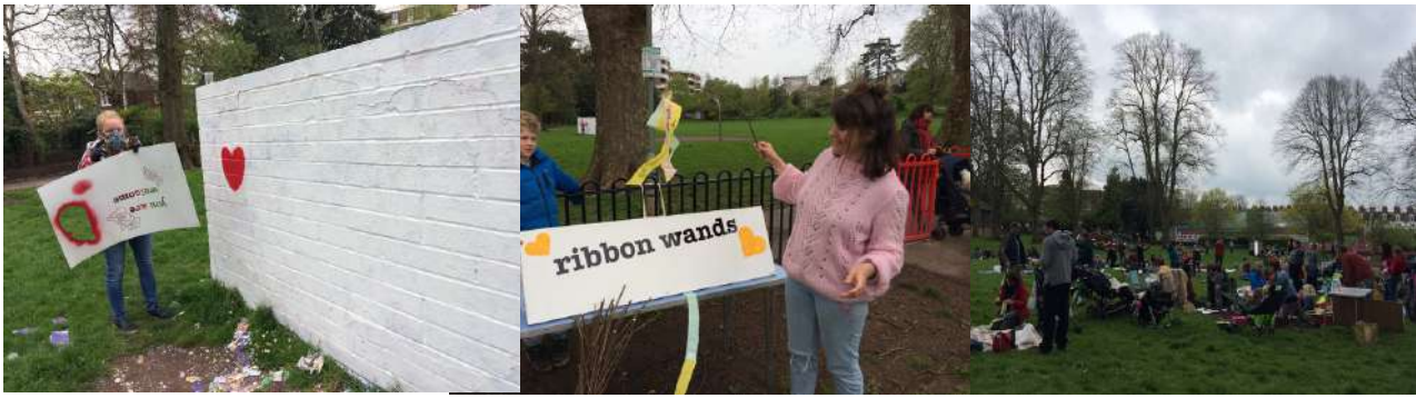
You Are Welcome Picnic, Belmont Park