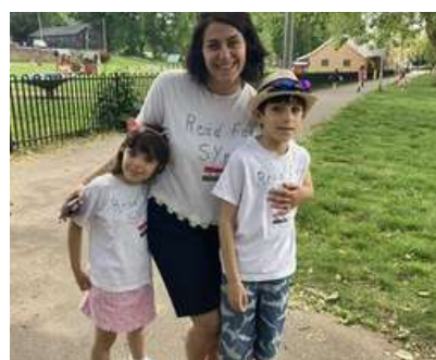
Trail for Syria