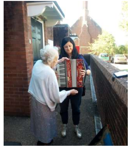
Music lesson, Gainsborough House