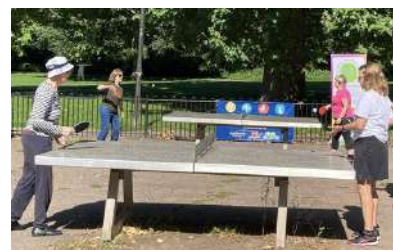
Table Tennis in Belmont Park