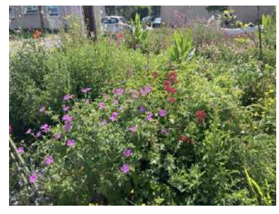
Newtown Wildflower Gardens for the Bees