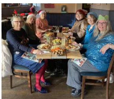
Newtown Knitting and Crochet Group