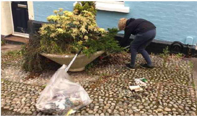
St Matthew's Church Litterpick