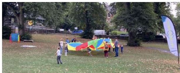
Freemovement Play Days