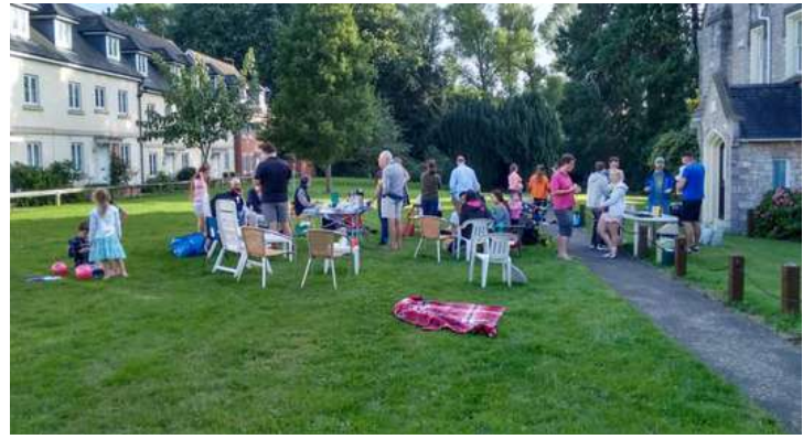
Wellingtonia Park Neighbours Get Together