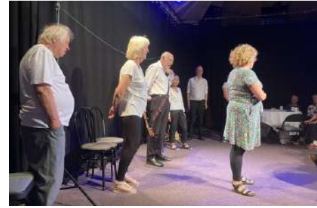
Cafe Theatre Company