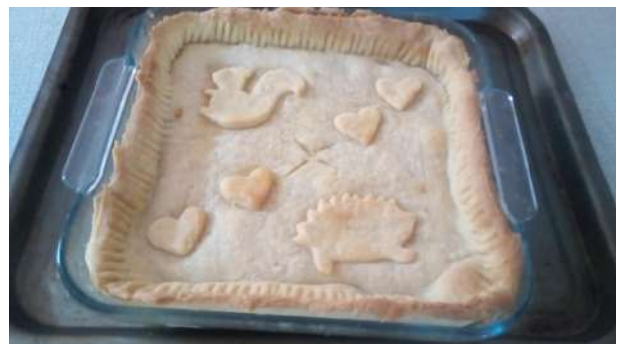
Apple Cake Off at Crossley House