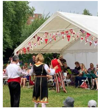
NCA Summer Music Event