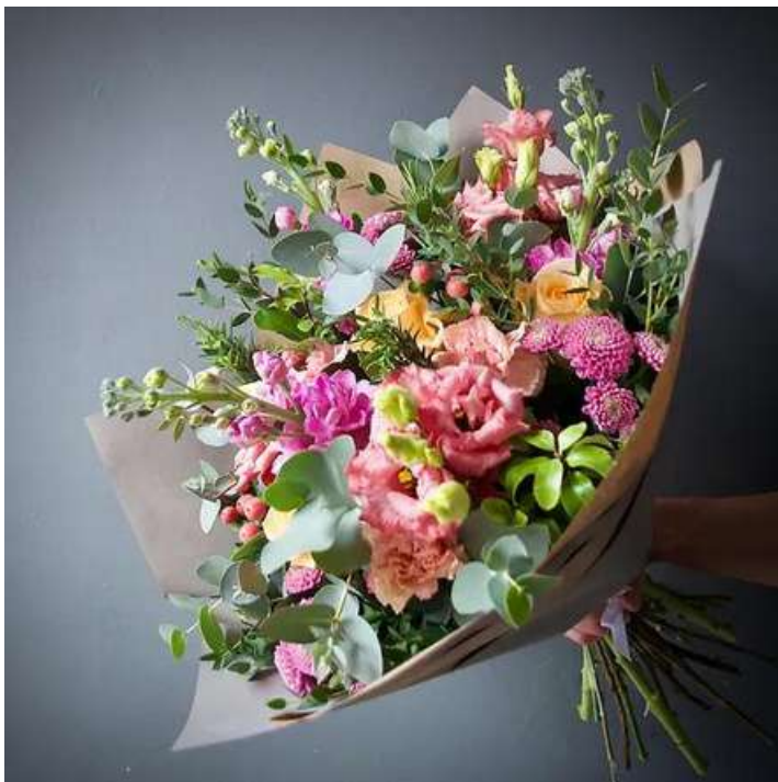
Topsham Flower arranging meet once a month Held in the Bradbury Cafe at Nancy Potter House Discussions, displays, talks and trips take place throughout the year additional fees/costs may occur Tue 12th December 2023 at 6:30 pm to 9:00 pm - Nancy Potter House, Nelson Close, Topsham EX3 0DX