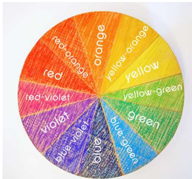
Friendly and creative art class for adults held at Nancy Potter House Topsham. For more information please see colourwheelartclasses.co.uk Wed 13th December 2023 at 12:30 pm to 10:00 pm - Nancy Potter House, Nelson Close, Topsham EX3 0DX