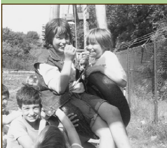
Mincinglake Orchard Play area in 1985

20 people benefitted from Harvest's cooking and preserving workshops