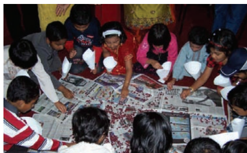
Malayalee children celebrate the Festival of Onam with games