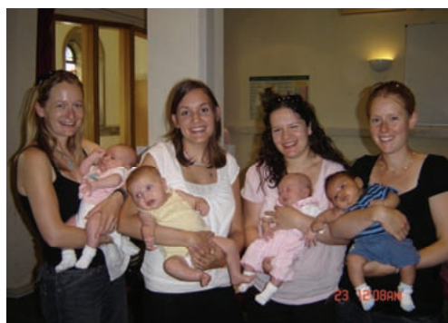
The Post Natal Support Group

"After a period of ill-health, it is good to start using my skills again with a view to returning to work." (Heuristic Play Volunteer)