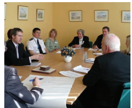
PORCH evaluation event