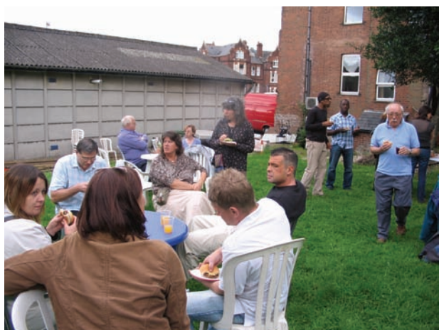
CARD and PORCH host a BBQ for their clients, volunteers and supporters

"When thinking about the word 'mentor' I imagined a person who could assist, yes, but there was more. This was a person who you could not only confide in but was a friend. Friends are in very short supply.. I applaud her honesty.. I have found the mentor scheme to be very beneficial." (A mentee)