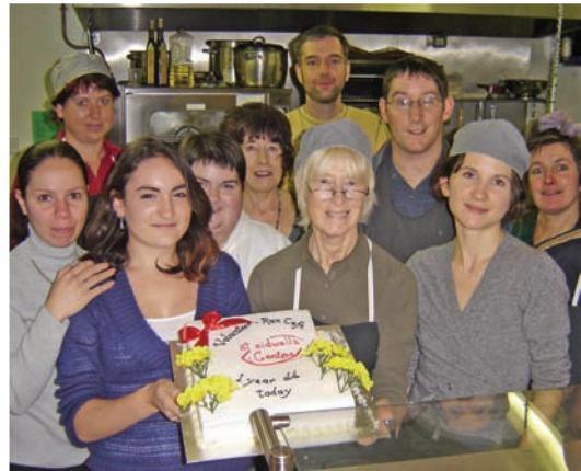
Anniversary celebrations at the St Sidwell's Café

During its first 6 months, PORCH provided support to 38 clients to find and sustain suitable accommodation, which is a constant challenge for an offender leaving prison. However, thanks to the co-operation of landlords, we have succeeded in placing 7 clients in private sector accommodation. They have all maintained their tenancies and this has had a significant effect on their ability to stay crime and drug free.