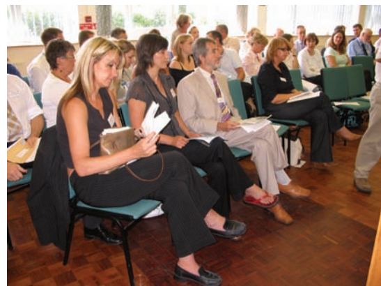
Launch of the PORCH project