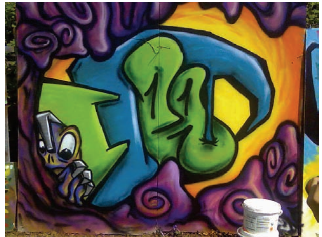
Graffiti art at the Exwick Festival

The early part of the year was focussed on organising the Exwick Youth and Community Festival on 1 st June. Over 500 people attended the day which included a wide range of activities such as a 'battle of the bands', a fun fair, a children's art zone, a football match, archery, and a networking event for funders and local organisations. Crucial to the festival's success was the involvement of volunteers. Our thanks to Devon Community Foundation for funding this event through the Local Network Fund.