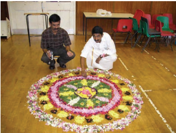
The Exeter Malayalee Association celebrate the Festival of Onam

The Ujima small grants fund has made 7 grants during the year including assistance with childcare costs for meeting/events for United Women (a group to support BME women), providing a small grant to an Exeter-based youth facility for travellers, and helping the Planet Rainbow Project (which supports families of mixed heritage) to employ a second play worker.