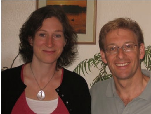
The Project Development Team