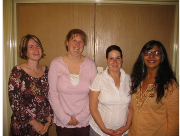
'Off to a Flying Start!'

Examples of the impact of this work include the allocation of £72,500 by Exeter City Council towards community capacity-building work in the city, with the establishment of a neighbourhood engagement pilot for 4 areas of the city; and a greater recognition by local partners of the importance of community development in reducing crime.