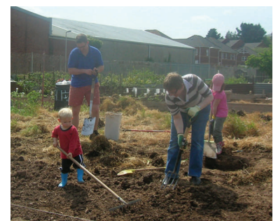
A family working on their allotment at the Guys & Hylton site