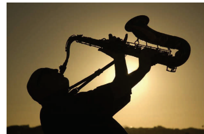
Exeter Cathedral Night Church helps STEPs to raise valuable funds

Our ambition is for financial independence for STEPs so ongoing fundraising will be of growing importance. Indeed by the time this newsletter is printed, we will have held a Jazz Concert in Exeter Cathedral and will plan even more events in the future - let us know of your ideas!