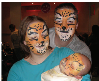
A family of tigers enjoys the Young Parents' Group Launch Event

A Mentor Development meeting was held recently with a focus on drugs misuse, which was led by a colleague from EDP Drug