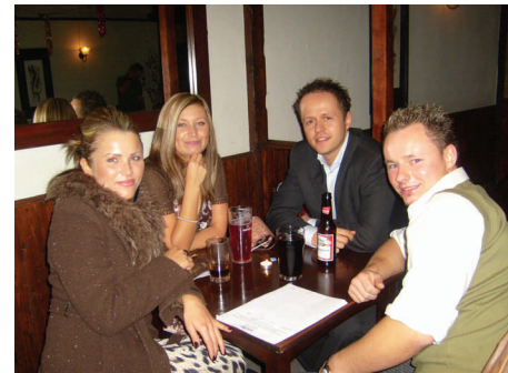
Polonica members celebrate Andrzejki

Future plans for Polonica include organising further events and they hope to start up a Polish Saturday School, where children of Polish migrant workers can learn about and maintain ties with their native culture and language.