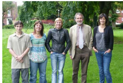
CARD PORCH Team members - Right

It becomes fully effective when the client wants to make the necessary changes. The volunteer mentors are fully trained and supported throughout their involvement.